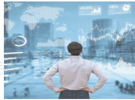
Data Driven Strategy