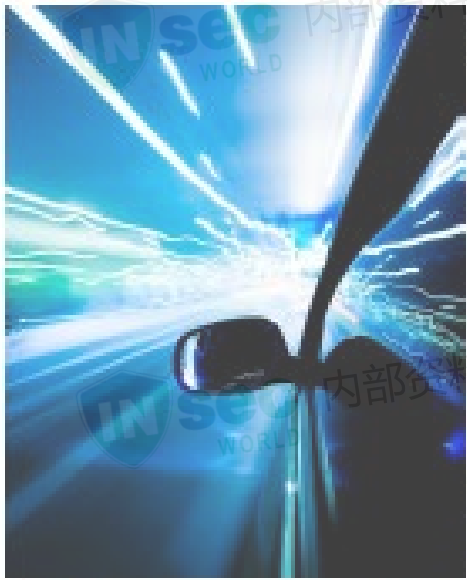
Future of mobility